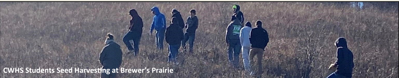
CWHHS Students Seed Harvesting at Brewer's Prairie