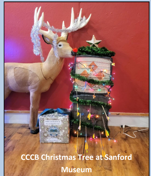
CCCB Christmas Tree at Sanford Museum